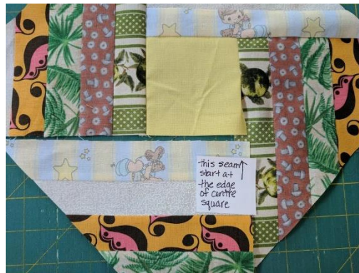
Start this seam at the beginning of the centre square