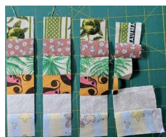
Back of Block

Remnant pieces cut into 1½” wide strips. Use as a border as desired.