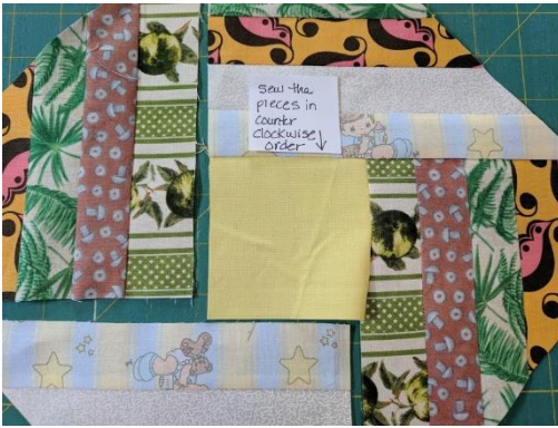
Sew the pieces to the centre in a counter clockwise direction